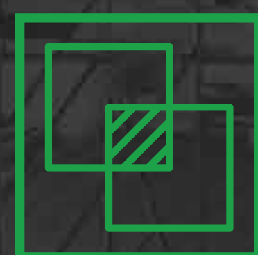
Image Fusion (day and thermal)

Temperature measurements capabilities and color pallets for better versatility.